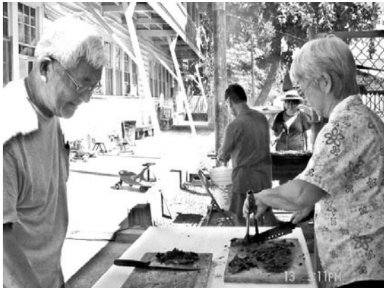
Meat grillers & slicers