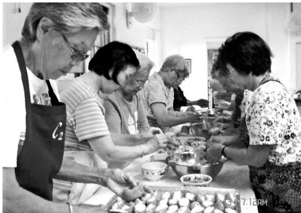
Every grain of rice accounted for in SUSHI, SUSHI, SUSHI.