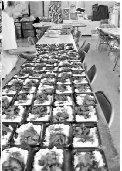
Awesome line-up !