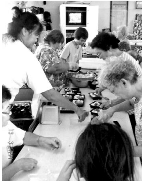
BENTO packers – “don't forget the ume”.