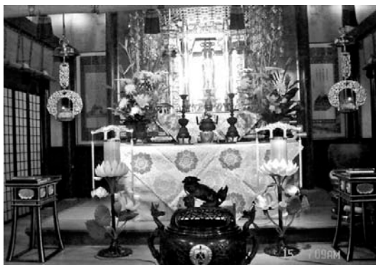
The altar was waiting for the Hatsubon Service. The Nokotsudo, nearly complete, was dressed up.

And so, was Lahaina Hongwanji ready for Obon 2011?