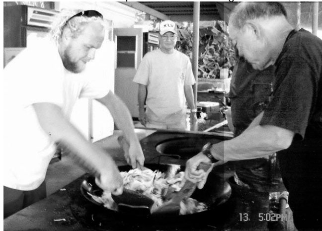
CHOW FUN gang number 3?